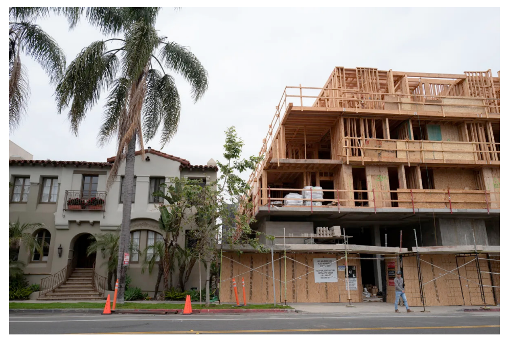
An apartment building under construction in Santa Monica on May 24, 2023. Red tape often slows such projects.

Sixty-plus years ago, the state's water managers proposed a canal around the Sacramento-San Joaquin Delta to complete the state project that carries water from the northern part of the state to the southern.